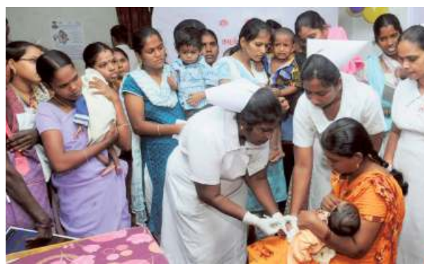
Hitting a hurdle: India had recorded steady improvement in immunisation coverage until the pandemic.