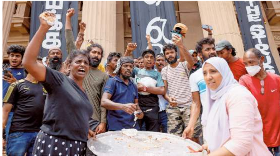
Heralding a change: Demonstrators celebrating at the Presidential Secretariat after the Speaker announced the resignation of Gotabaya Rajapaksa in Colombo on Friday.

According to the Sri Lankan Constitution, if the office of the President falls vacant, a new President must be elected through Parliament within one month. Acting