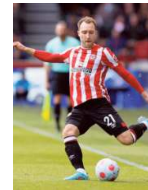
Eriksen.

Eriksen is United's second recruit in the close season under new Dutch manager