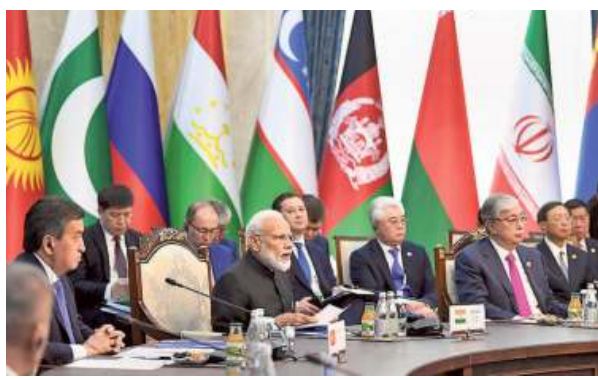
Prime Minister Narendra Modi at the SCO Summit in Bishkek, Kyrgyzstan, in this file photo.

"So far, all participating countries have confirmed the attendance of their leaders but the format of atten-