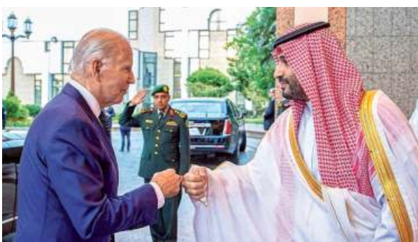
Reviving ties: Saudi Crown Prince Mohammed bin Salman, right, greeting President Joe Biden in Jeddah.

There was little evidence of any warmth between the leaders, and none of the backslapping or smiles that