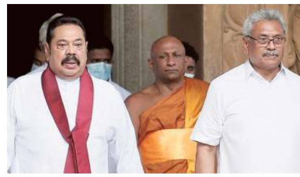
Mounting troubles: Mahinda Rajapaksa, left, with his brother Gotabaya Rajapaksa in Colombo, in this file photo.

The order was passed by the apex court during the hearing of a petition filed by global civil society organisation Transparency International on the economic crisis in Sri Lanka.