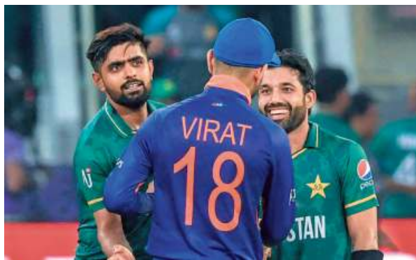
Stay strong! Babar Azam, left, says Kohli needs everyone's support during these tough times.

"I just feel that in the present situation Kohli needs support and to be backed. I tweeted wishing him the best because I know how a player feels when he is going through this period and he needs the support of everyone," Babar said on Friday at a pre-match press conference ahead of Pakistan's