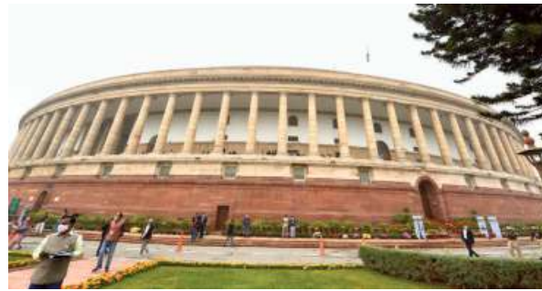
A view of the Parliament House in New Delhi.

Congress general secretary (communication) Jairam