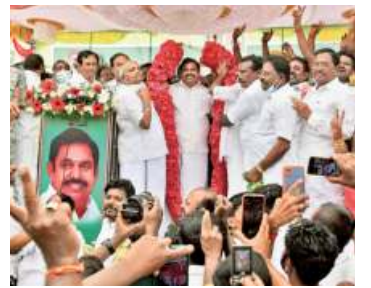
Party functionaries garlanding AIADMK interim general secretary Edappadi K. Palaniswami in Salem on Friday.

Amidst a rousing reception by party cadres in his native Salem district, AIADMK interim general secretary Edappadi K. Palaniswami on Friday charged that "traitors" joined hands with the ruling DMK and got the AIADMK headquarters sealed. "It belongs to the AIADMK cadre, and was given to us by our leader M.G. Ramachandran. No one could harm or touch the headquarters until the last party worker is alive," he said.