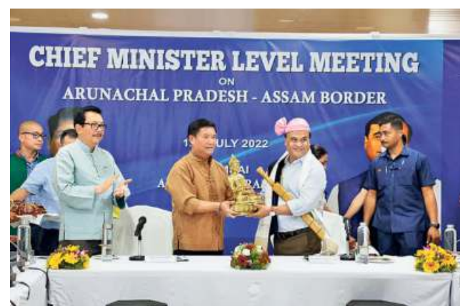
Arunachal Pradesh CM Pema Khandu and his Assam counterpart Himanta Biswa Sarma at the signing of the Namsai Declaration in Arunachal Pradesh on Friday.

Present-day Arunachal Pradesh, which attained Statehood in February 1987, used to be the North East Frontier