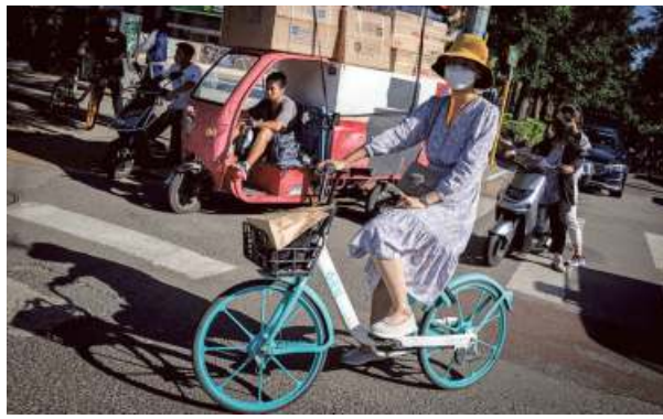
Costly curbs: Lockdowns impaired economic activity across key cities with output in Beijing shrinking 2.9%.

Gross domestic product in the April-June quarter grew 0.4% from a year earlier, official data showed on Friday. That was the worst showing