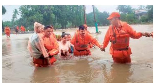
Raining misery: NDRF personnel rescuing stranded people from Gandevi town in Navsari district on Friday.

"By next Monday, it will become normal in the State. We have managed the situa-