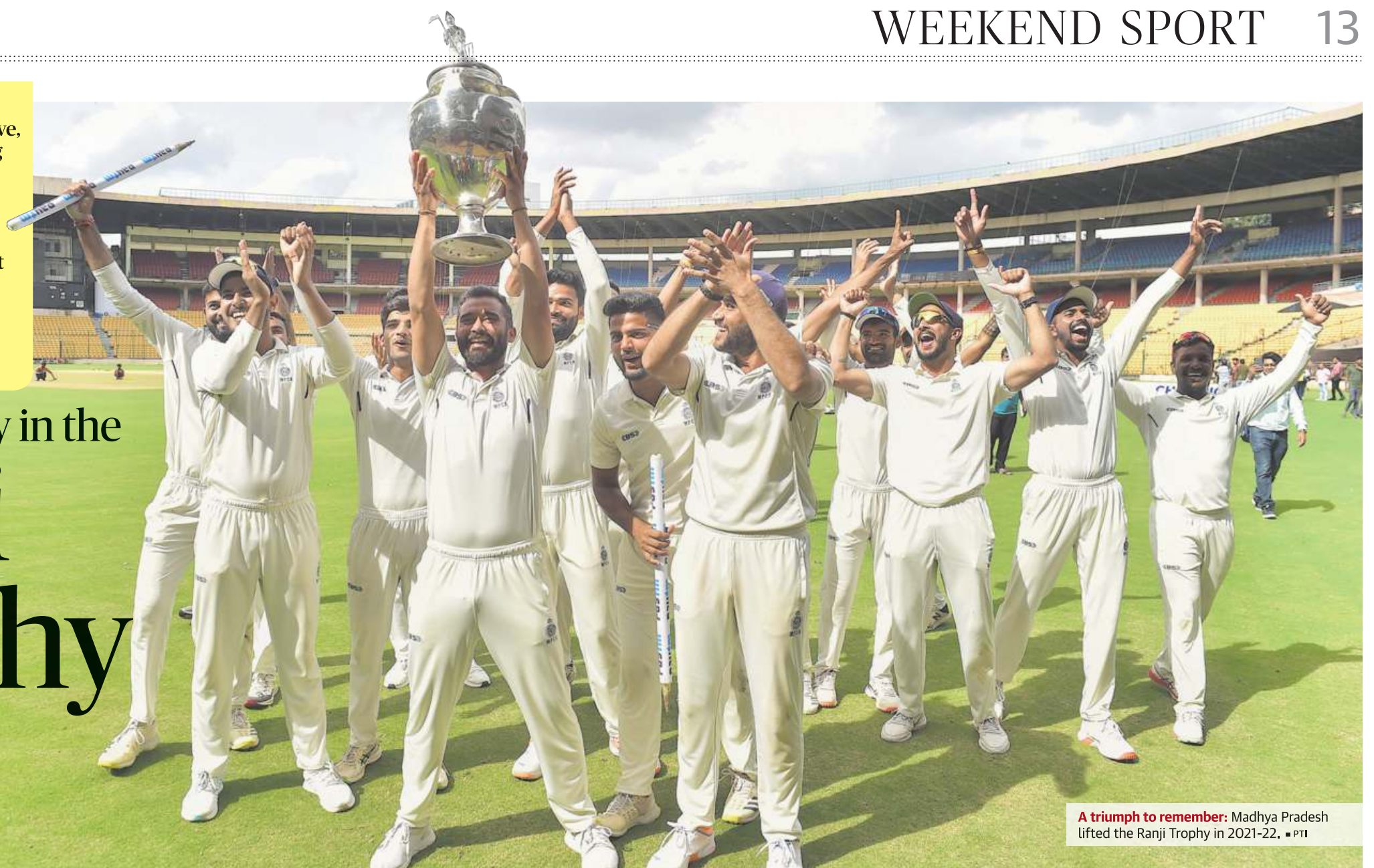
A triumph to remember: Madhya Pradesh lifted the Ranji Trophy in 2021-22.

India's premier domestic cricket tournament has improved over the years, but more needs to be done to bolster its relevance and health