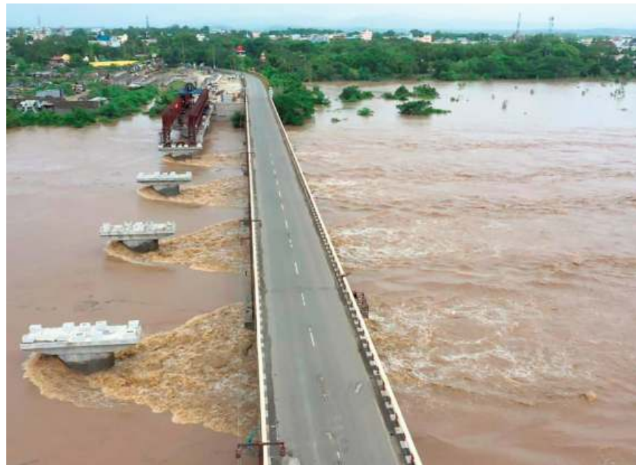
Turbulent times: The 57-year-old bridge across Godavari river that has been closed in view of heavy flooding in Bhadrachalam town in Telangana. • SPECIAL ARRANGEMENT (REPORT ON PAGE 5)