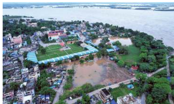
Water world: With Godavari in spate, several low-lying areas in Bhadrachalam have gone under water.