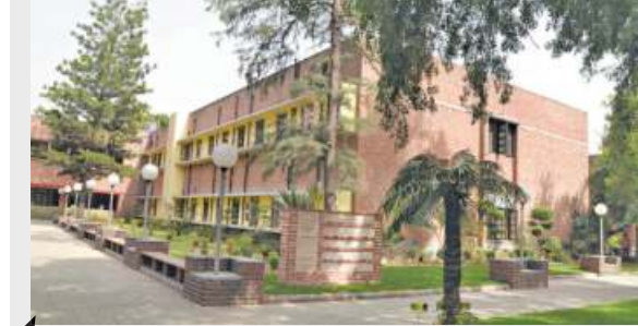
DELHI COLLEGES IN NIRF'S TOP 15