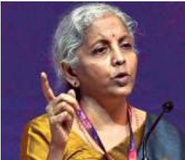
Nirmala Sitharaman

She said the poor in the poorest countries were the most directly affected, setting back development, and undermining efforts to eradicate poverty.