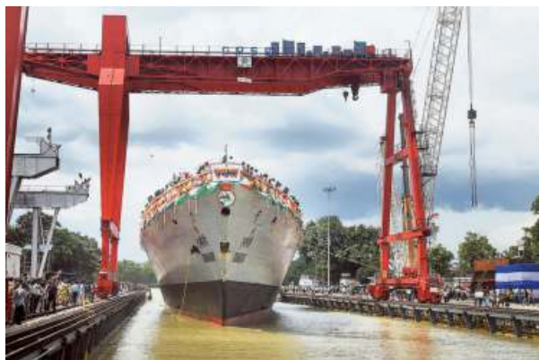
The P17A stealth frigate 'Dunagiri' ship built by Garden Reach Shipbuilders Limited (GRSE), after its launch in Kolkata. (Right) Union Defence Minister Rajnath Singh launches the ship in presence of Navy Chief Admiral R. Hari Kumar.

"One of our neighbouring countries is struggling with religious fanaticism, bigotry and narrow-mindedness. The country itself is struggling with poverty, unemployment and terrorism and sometimes it tries to harass India also. That country needs to introspect and learn a lot from Bangladesh," he said at an event in Kolkata. While Mr. Singh did not name Pakistan, his remarks