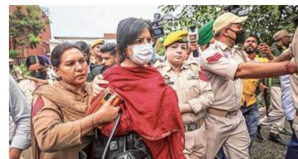
Legal proceedings: Rubaiya Sayeed arriving to appear before the court in Jammu on Friday.

“When she made her statement (before the court) she categorically stated that he (Yasin Malik) is the one. She said he is the one and