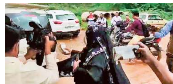
A video grab of the woman, who threw away the money offered by Siddaramaiah.

Mr. Siddaramaiah, while on a tour of Bagalkot district wanted to talk to some family members of the injured