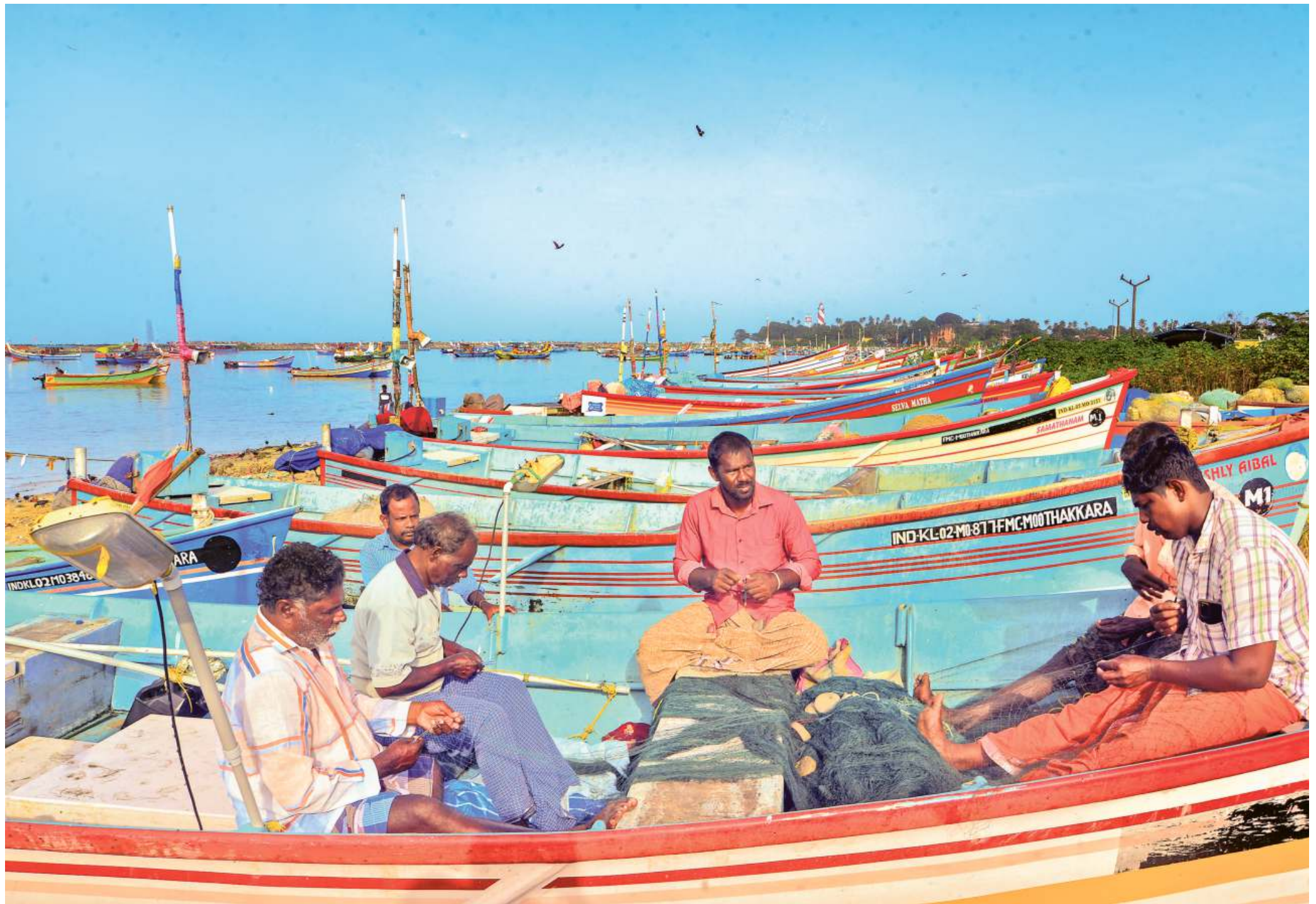
Fishermen mend nets at Tangassery harbour in Kollam district after all fishing operations were suspended following an alert about the sea being rough. (Below): A fisherman carries home an outboard engine in Tangassery harbour following the alert. ■ C. SURESH KUMAR

There is an increasing sense of desperation in the community, says Jackson Pollayil, a fisher from Thiruvananthapuram and the president of the Kerala Swatantra Matsyathozhilali Federation. Minimum Legal Size (MLS) refers to the size at which a particular species can be caught legally. Fishers used to leave oil sardines of 10 cm in the past, capturing bigger ones. It is a prolific breeder producing around 80,000 eggs in a spawning season. "But total oil sardine landings during the last couple of years present an alarming picture. Today, fishers net oil sardines once they acquire the MLS (even though the sardines are yet to reach the reproductive