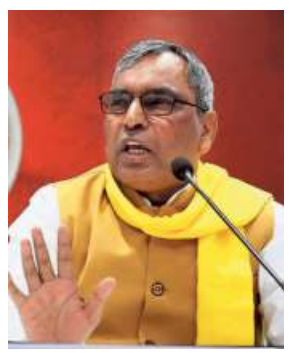
Om Prakash Rajbhar

Signs of discomfort in the Uttar Pradesh Opposition alliance have been visible for a while. Mr. Rajbhar attended a dinner hosted by the